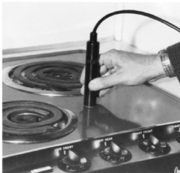
FIG. 3 Applying the Thermesthesiometer to a Horizontal Surface

8.1.3 The maximum hot surface temperature expected in Method A and its method of determination.