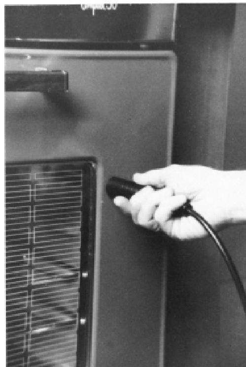
FIG. 4 Applying the Thermesthesiometer to a Vertical Surface

8.1.4 The design contact time of exposure.