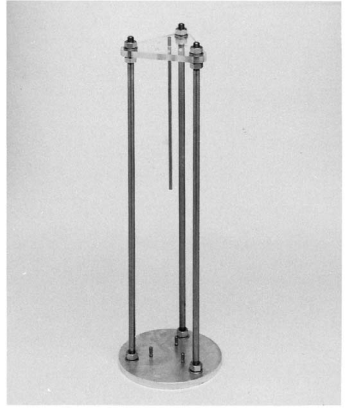
FIG. 1 Core Measuring Apparatus

3.1 The apparatus shall consist of a 3-point calipering device that will measure the length of axial elements of the core. While the details of the mechanical design are not prescribed, the apparatus shall conform to the requirements of 3.2 to 3.6.<sup>2</sup> An example of the apparatus is illustrated in Fig. 1.<sup>3</sup>