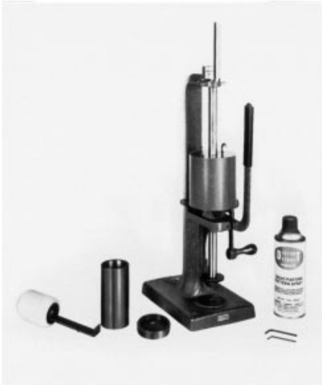
FIG. 1 Apparatus for Workability-Index Test