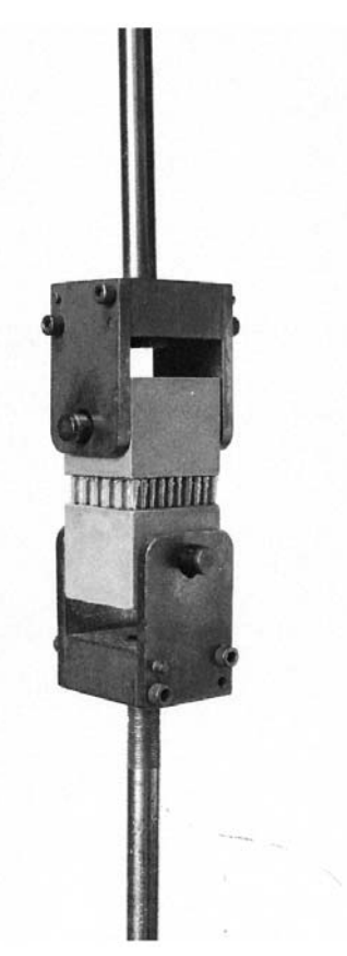
FIG. 1 Flatwise Tension Test Setup

indicate the force with an accuracy over the force range(s) of interest of within \pm 1 % of the indicated value.