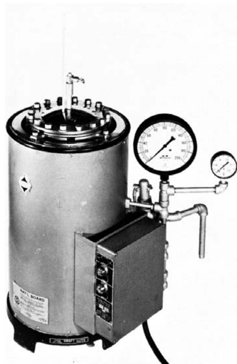
FIG. 1 Suitable Apparatus for Measuring Hydration Resistance of Basic Brick and Shapes (See 1)

4.1 The test specimens shall be 1-in. (25-mm) cubes cut from the interior of basic refractory brick or shapes so that no original surfaces are present. Only one specimen shall be cut from each of five bricks or shapes.