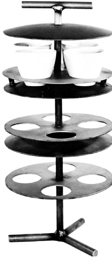
FIG. 2 Suitable Rack for Protecting Specimens from Drip or Condensate

5.5 Allow sufficient cooling to lower the autoclave to 20 to 30 psi (138 to 207 kPa) with the release valve closed, and then carefully open the relief valve to reduce the autoclave to atmospheric pressure in a total time between 30 and 60 min. Remove the specimens and examine them.