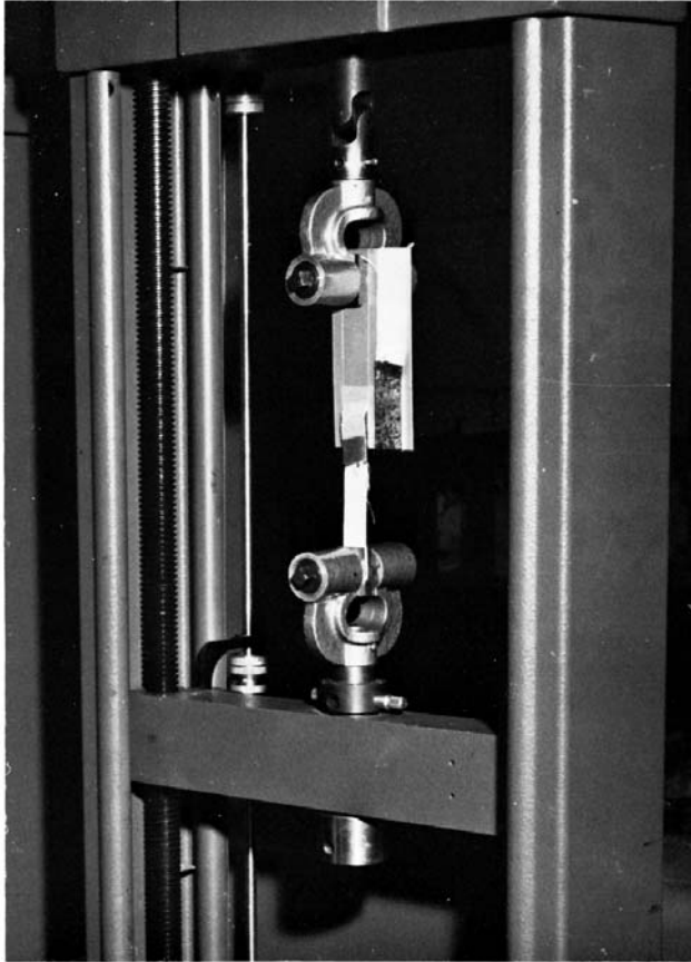
FIG. 2 Extension Machine Used in the Adhesion-in-Peel Test