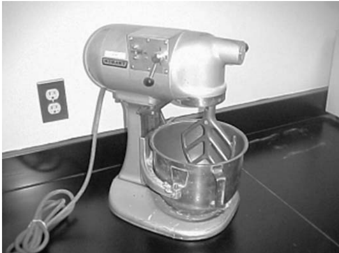
FIG. 1 Five Quart Hobart Mixer