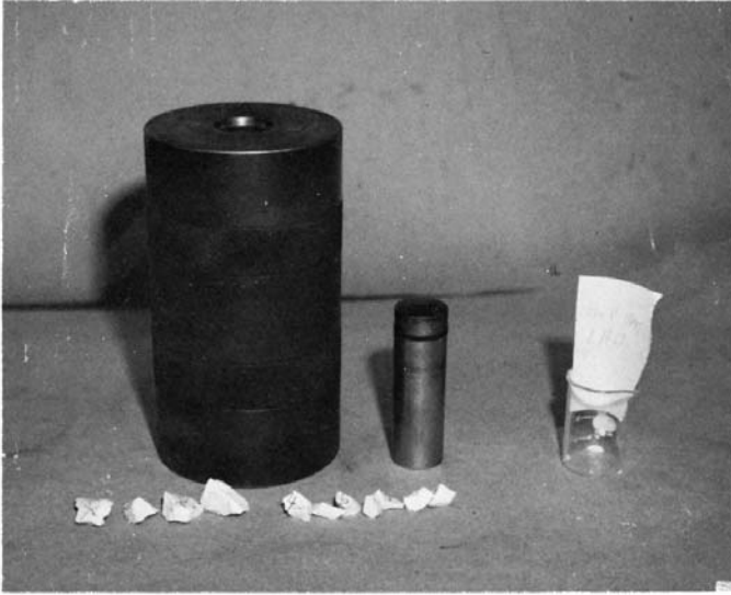
FIG. 2 A Typical Unassembled Pressure Vessel and Samples