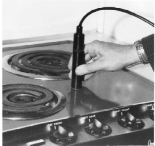
FIG. 3 Applying the Thermesthesiometer to a Horizontal Surface

8.1.3 The maximum hot surface temperature expected in Method A and its method of determination.